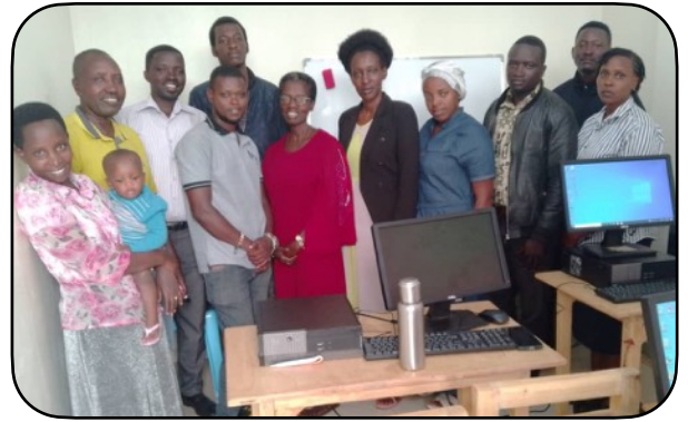
The Bridge of Solidarity leadership team in their newly opened computer lab.

BoS also hosts work sessions where refugees can use the computers to apply for academic scholarships , jobs, and other opportunities. To sustain the program, they offer printing, scanning, typing, and photocopy services to community members for a small fee. BoS is a wonderful example of the vision and generosity of SIA Grant Partners!